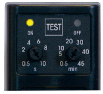
Bright LED illumination, indicating operating status