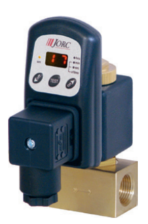
Also available in a FLUIDRAIN valve version

The D-LUX feature is a digital timer setting applied on time controlled condensate drains designed to automatically remove condensate from compressed air systems.