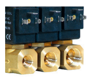
Various connection options

Timer cycle range (ON/OFF) Timer PCB Timer cycle indication