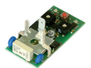
Highest quality PCB SMD technology, ensuring consistency in production

Timer cycle range (ON/OFF) Timer PCB Time cycle indication