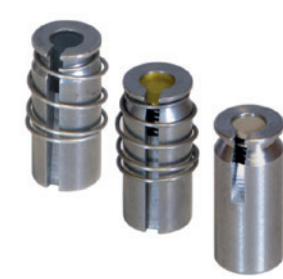
Service kits available

0.5 – 10 seconds / 0.5 – 45 minutes SMD technology, ensuring consistency in production Bright LED illumination