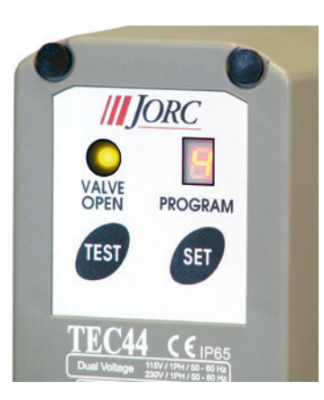
Bright visual display of selected program!