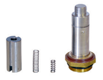
Service kits available

0.5 – 10 seconds / 0.5 – 45 minutes SMD technology, ensuring consistency in production Bright LED illumination