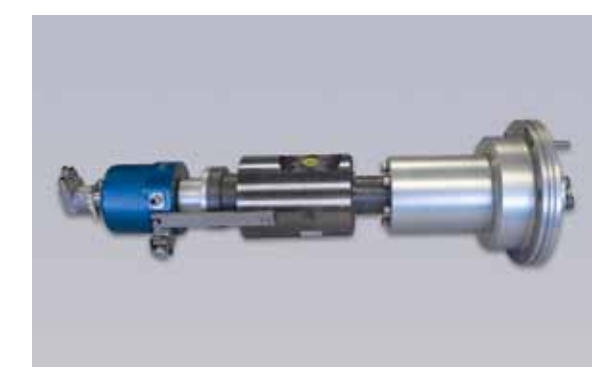
Off-shore wind turbine union, slip ring and encoder. A complete DEUBLIN solution providing hydraulics, electrical power, EtherCAT and position.

As with all DEUBLIN products, our slip ring product line is 100% tested prior to installation in the field and manufactured using high performance production methods. The long-life slip ring technology will provide consistent, reliable service and maintenance-free performance.