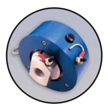
Rugged 1 channel slip ring with thru bore for construction industry