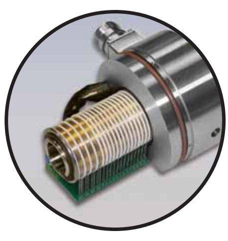
Slip ring without cover, using wires on gold-plated rings