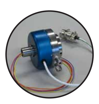
Slip ring and union combination in one integrated assembly