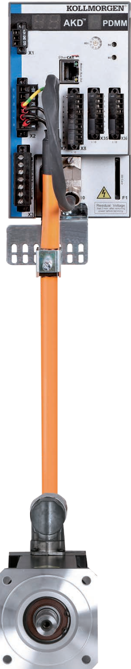
The powerful AKD PDMM servo drive with integrated motion control and an AKM servo motor. Just one example of the flexibility of Kollmorgen's modular single-cable system.